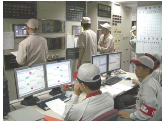
J-POWER's upgraded RTDS Simulator (left) and closed loop test of HVDC controls (right)

J-POWER (formerly known as the Electric Power Development Co., Ltd. or EPDC) is a wholesale utility company in Japan and is a leading user of the RTDS Simulator in Asia. A recent project using the simulator involved testing the control system for the Hokkaido-Honshu HVDC Link. The link, which is operated by J-POWER, is a bi-polar, +/-250kV, 600MW, DC system with a submarine cable linking Japan's two major islands.